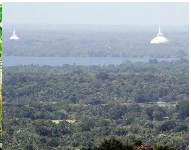
Sri Maha Bodhi Tree and Stupas in Anuradhapura (Ancient Buddhist Capital) ( http://en.wikipedia.org/wiki/Anuradhapura )