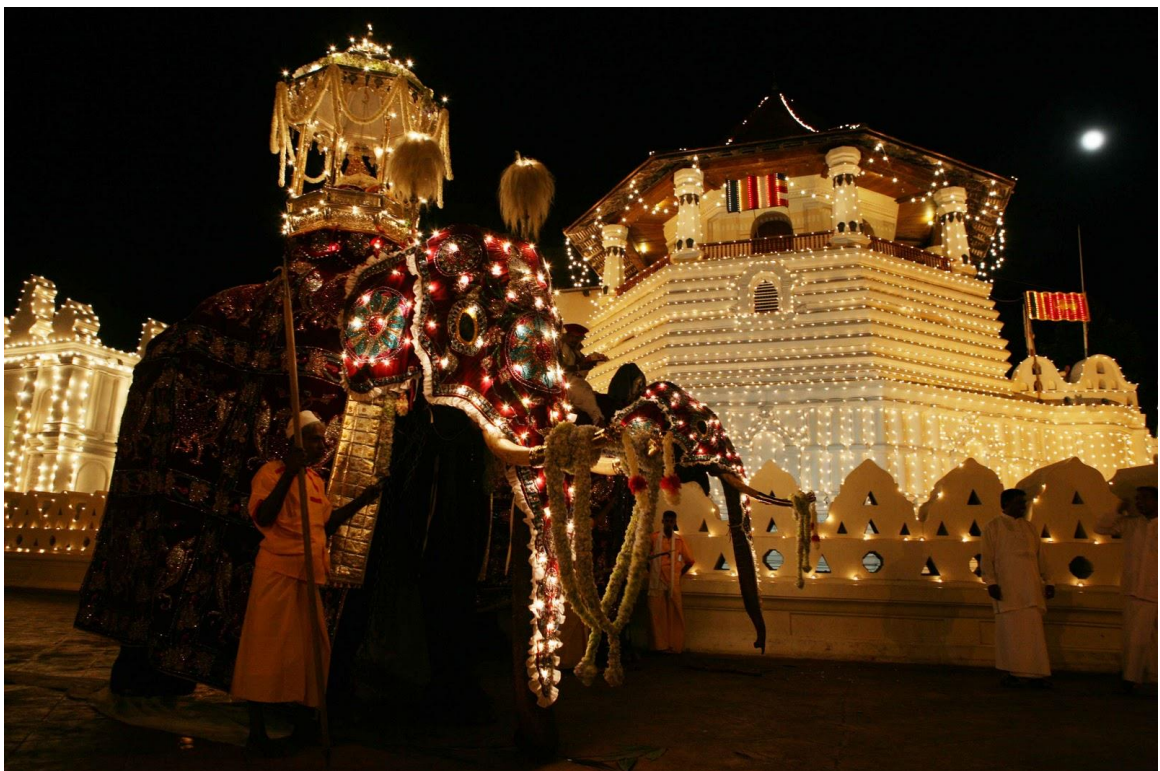
Kandy Tooth Relic Temple

( http://en.wikipedia.org/wiki/Pinnawala_Elephant_Orphanage )