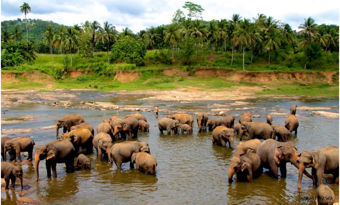
Pinnawala Elephant Orphanage

( http://en.wikipedia.org/wiki/Pinnawala_Elephant_Orphanage )