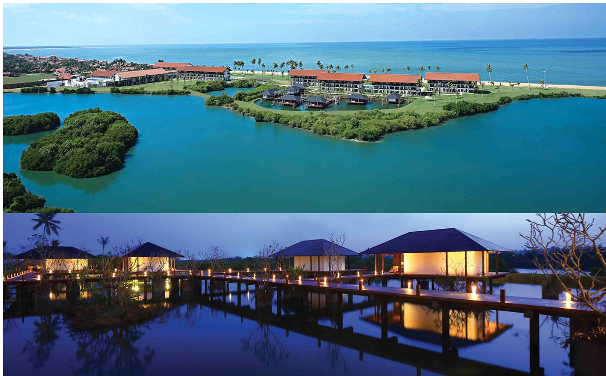
Retreat with Ringu Tulku Rinpoche at Anantaya Resort and Spa (Anantaya means 'Infinity': http://www.anantaya.lk/ )