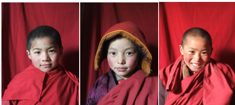
Three of the fifteen little orphan girls taken in by the nuns at Chodrak nunnery.